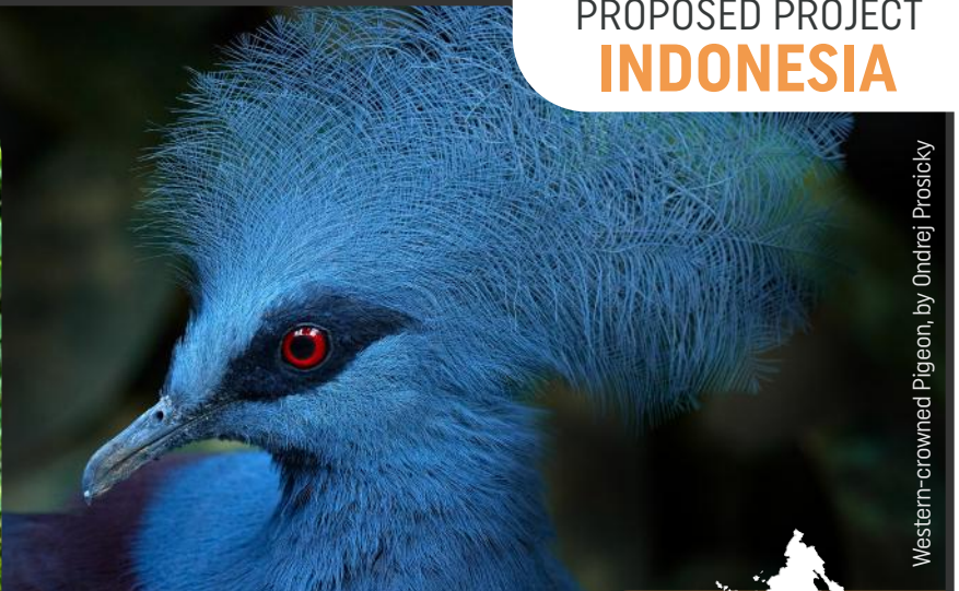
Western-crowned Pigeon, by Ondrej Proszicky