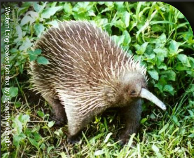
Western Long-beaked Echidna, by Jaganath/Wikipedia