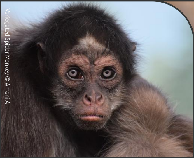
Variegated Spider Monkey