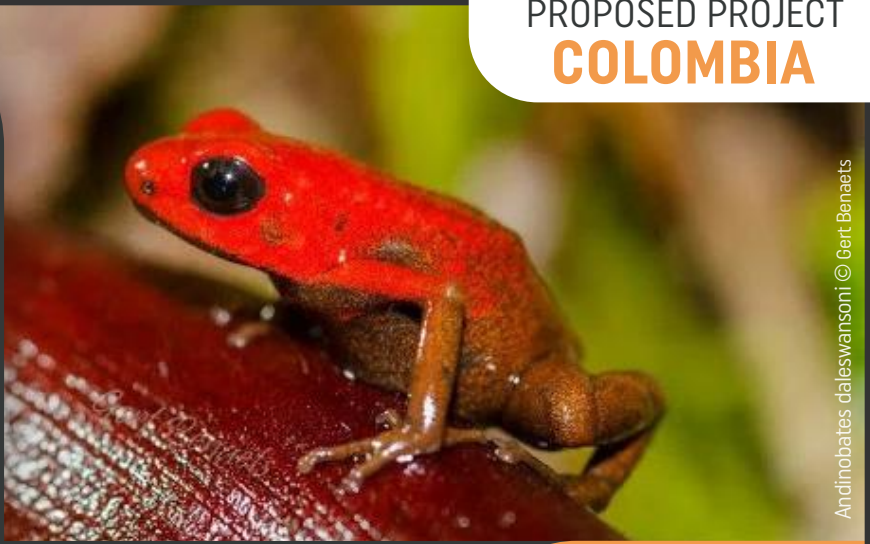
Andinobates daleswansonii © Bert Benaets